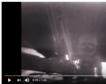
First Moon Landing 1969

On July 20, 1969, Neil Armstrong became the first human to step on the moon. He and Aldrin walked around for three hours. They did experiments. They picked up bits of moon dirt and rocks.